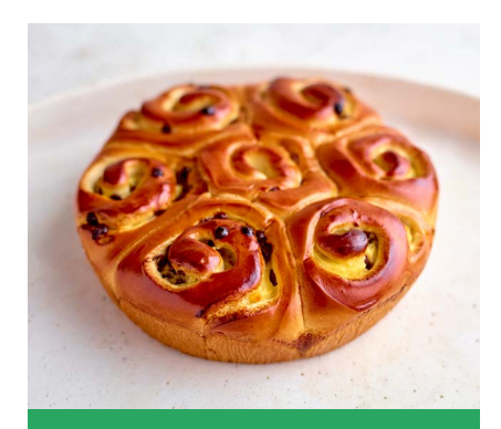
Egg wash alternatives