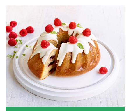
lcings and frostings